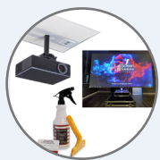
COMPLETE Projection Packages