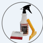
PRO APPLICATION KIT